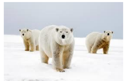
Animals in the Arctic