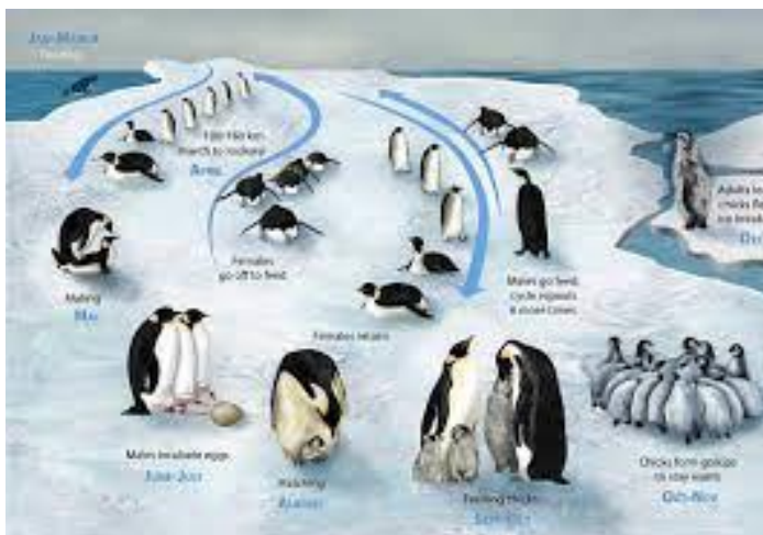
Emperor Penguins in Antarctica